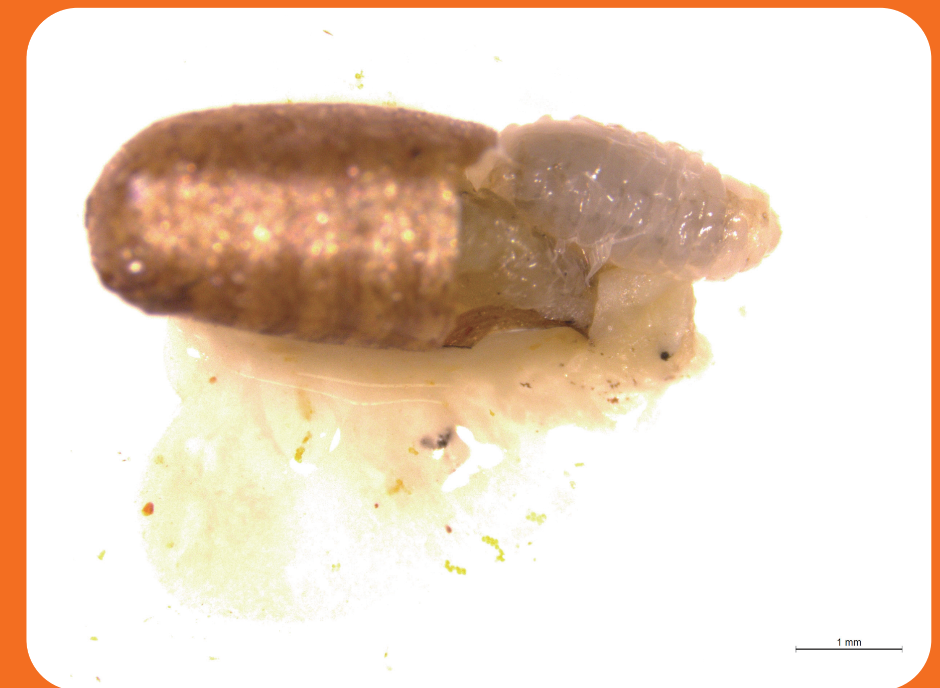
Larve stage : 9-10 days