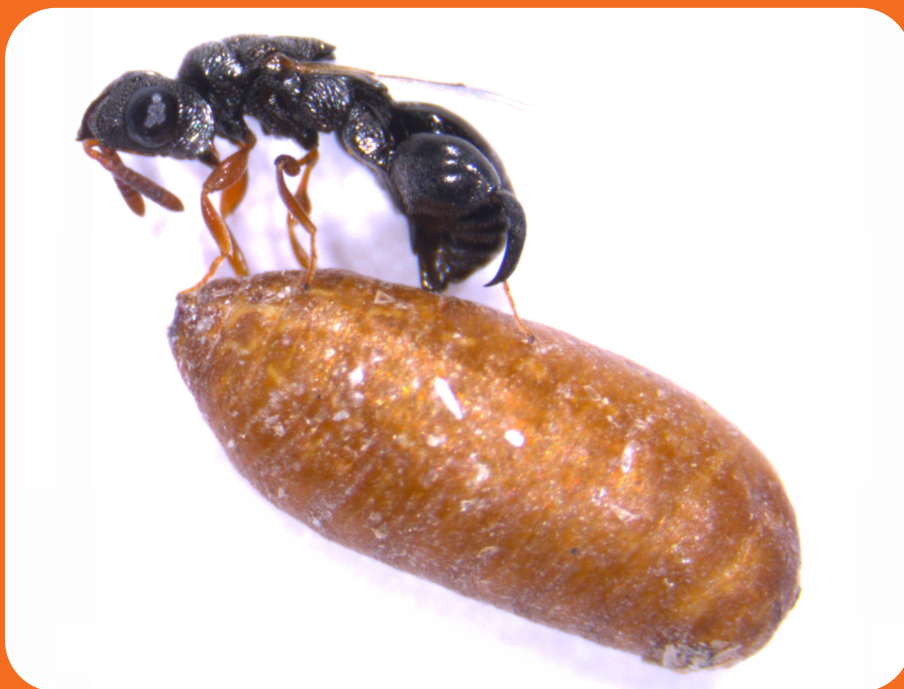
Adult stage : 20 days